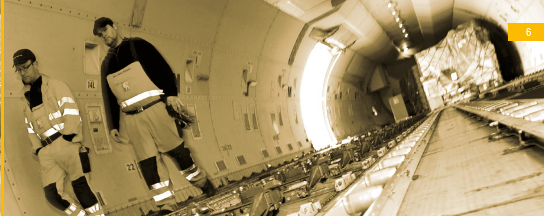
Cologne Bonn Cargo