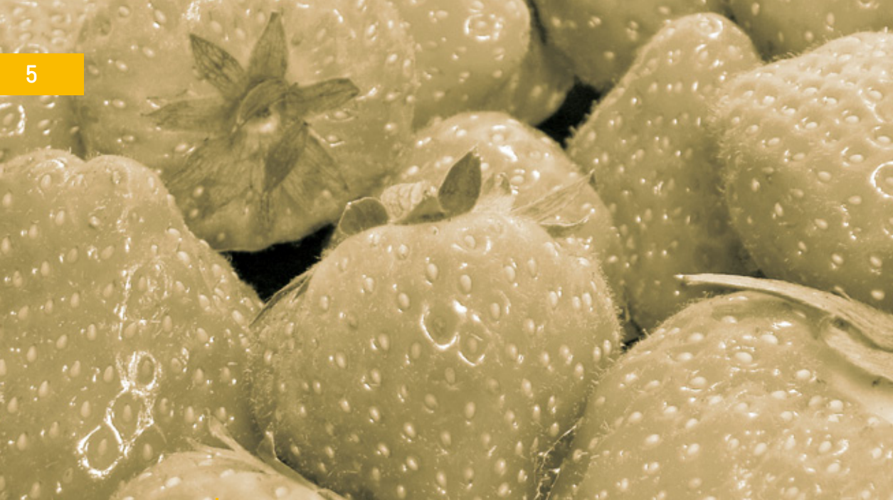
Cologne Bonn Cargo