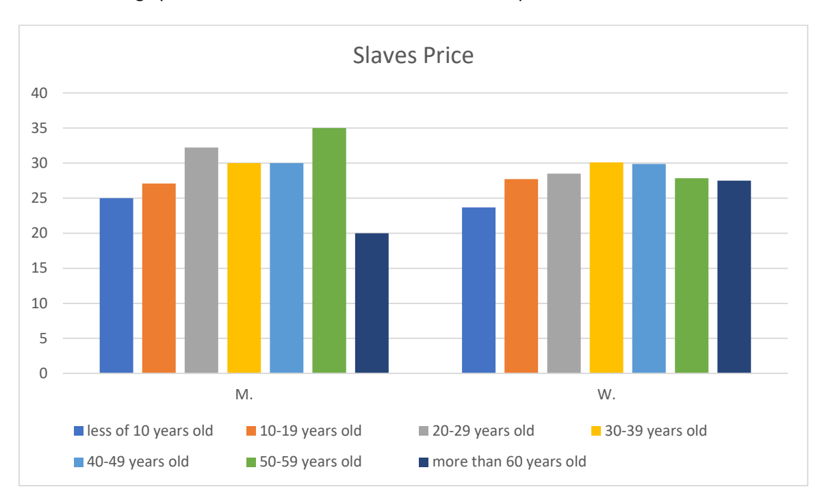
Table 5. Average price of slaves introduced in Valencia in the period 1569–1570