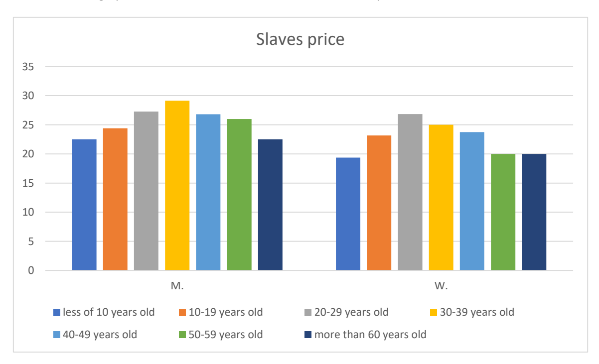
Table 3. Average price of slaves introduced in Valencia in the period 1571–1578.

In this first graph, the ages of 478 slaves are extrapolated from the documents of the ARV, divided between men and women. As we can see, in both cases, most of them were very young, aged between ten and nineteen: