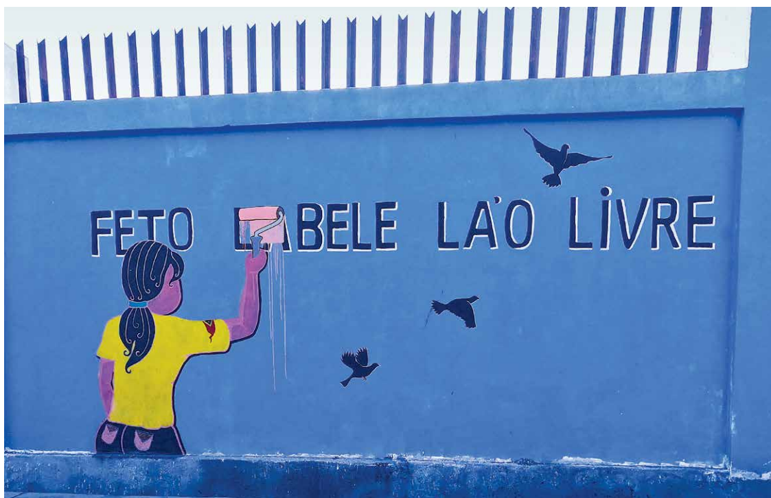
“Women cannot move freely”, the group Buibere nia Riska painted murals concerning the socioeconomic function and participation of women on the walls of the national stadium in Dili in september 2019.

In a process of mediation between the uncles as male representatives of their families, the type and amount of barlaki is determined, with the aim of tying the families together and sealing the union. This practice excludes women from the decision making process in two ways: for centuries they could neither decide what kind of marriage they wanted, nor what conditions should apply to the husband's family. This led to the practice being reinterpreted as a dowry, with the men gaining ownership of the women, who are in turn commodified, making some men feel justified in regulating, controlling or domestically abusing their wives.