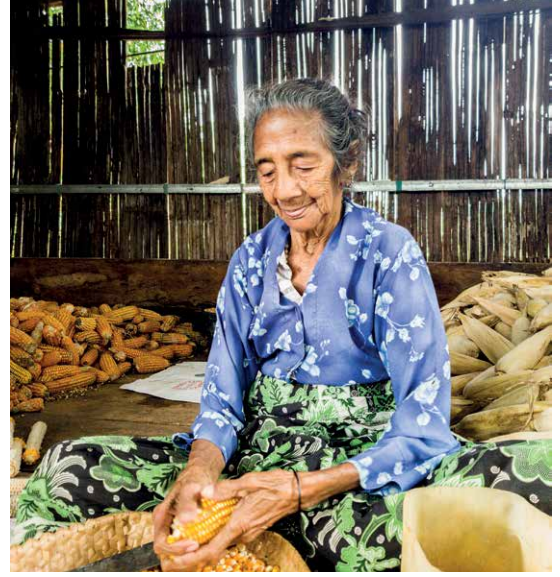
right: Woman preparing the fruits of harvest.