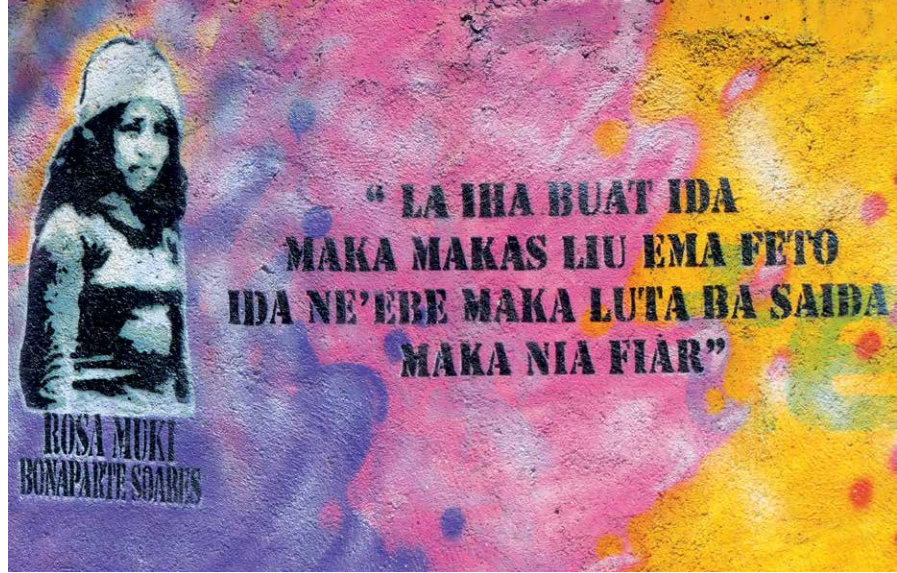
Rosa Muki Bonaparte: „Nothing is stronger than a woman fighting for what she believes in“ Graffiti in Dili

The key commonality uniting these practices is that women's involvement is usually indirect or passive.