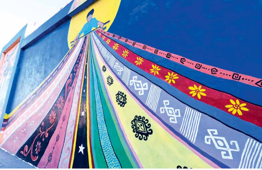
left: Woven history: the group Buibere nia Riska painted murals concerning the socio-economic function and participation of women on the walls of the national stadium in Dili in September 2019.