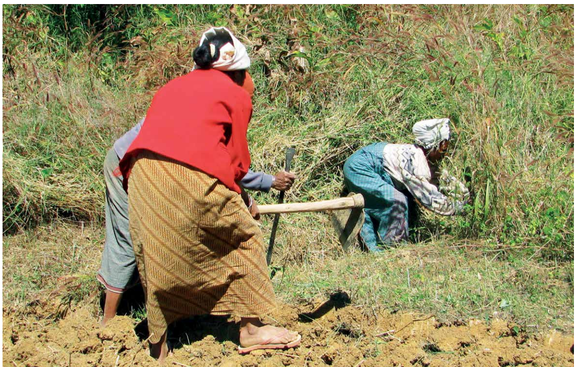
Women working the land

Muki, a women’s rights activist, member of the FRETILIN national committee and general secretary of the East Timor Popular Women’s Orga-