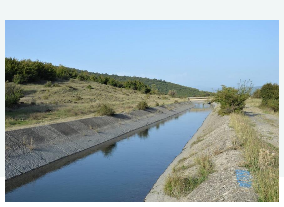
Example of an irrigation channel in Georgia

The implementation of the adaptation measure Irrigation systems in Agriculture has also positive effects on employment. Up to 10,000 additional people can be employed. This corresponds to an increase of up to 0.6 % in one year in the period under review (see Figure 1). Analogous to the effects mentioned above, this additional employment takes place in different economic sectors: on the one hand directly in the agricultural sector, but on the other hand also in the sectors for additional consumption and in the transportation sector. Since the model assumes an increasing productivity in the respective economic sectors, the additional employment decreases over time but remains clearly positive.