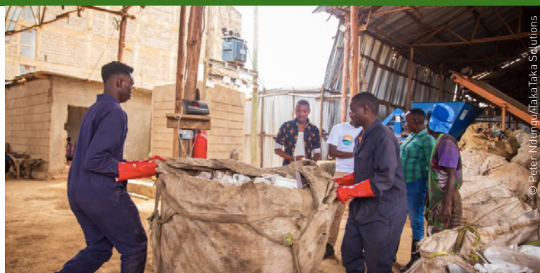
Employees at TakaTaka Solutions, a recycling business in Kenya supported under the 'Circular Economy 4 Africa' initiative, are weighing plastics at the Thika buyback centre.

The consortium focuses on the short- and medium-term creation of new and improved jobs including ad hoc Covid-19 activities in the circular economy to improve health conditions in the partner countries. It commits to the development of private sector cooperation dedicated to a green economic transformation in Africa.