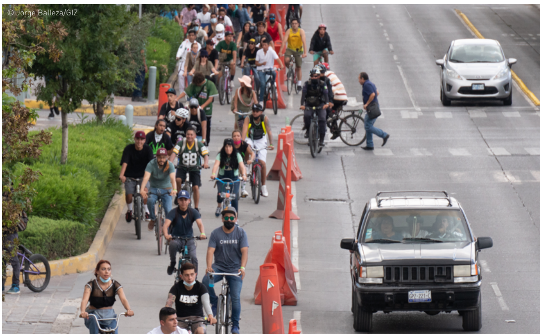
Green recovery measures for transforming urban mobility: Pop-up bike lanes were set up in the city of León, Mexico. To learn more, see snapshot number 13 .

Green recovery is a widely used term for packages of measures addressing the social, economic and political consequences of the Covid-19 crisis in a way that sets a course for long-term structural reforms and a transformative shift towards sustainability, biodiversity protection, resilience and climate neutrality.