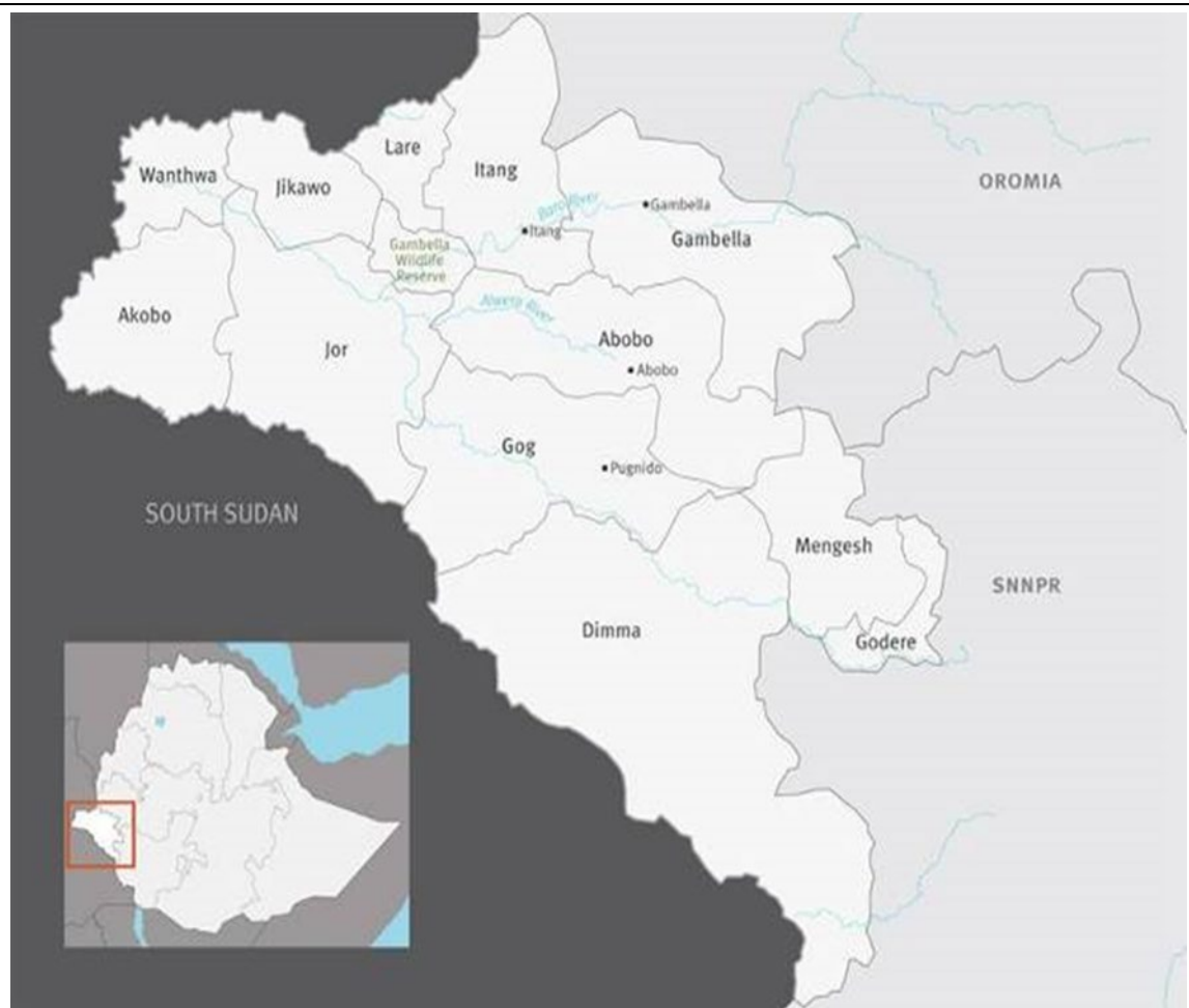
Figure 1: Map of the Gambella People's Regional State