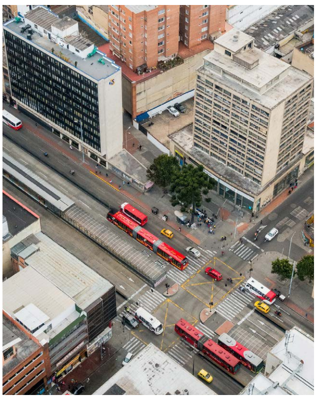
The red TransMilenio busses are powered by diesel and emit lots of pollutants.

Vehicle emissions became the biggest problem for the city's air quality from the 1970s. Back then, gasoline vehicles were the main means of transportation in Bogotá. Old models with outdated technology have filled