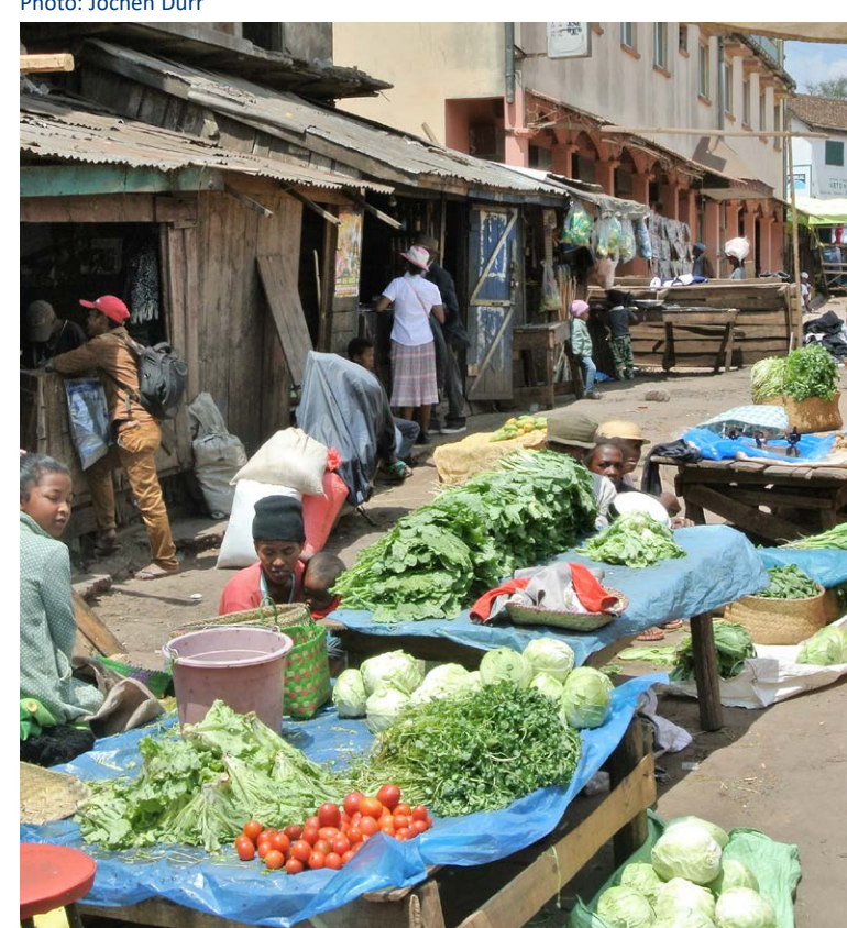
People buy and sell food at a market in Madagascar.