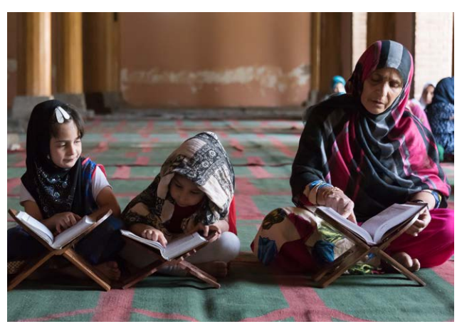
Health and nutrition of women and children are affected by gender inequality.

Domestic violence and its accompanying emotional and mental distress affect children's health too. The <a href="Demographic and Health Survey">Demographic and Health Survey</a> (DHS) Pakistan 2019 shows that 28 percent of women of reproductive age in Pakistan experienced physical violence at home, 7 percent experienced violence during their pregnancy, and 3