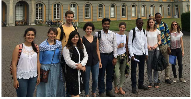
One Health graduate school students before the pandemic.

One conclusion drawn at the symposium was that future One Health research has to place more focus on practical applications. While the concept of One Health is convincing and gets traction at the international level, it remains unclear how to best operationalize the approach. One Health has to transcend its focus on infectious diseases towards a more integrative approach that looks at social, economic, and environmental determinants of health. The integration of ethical debates into One Health is also required to address issues of equality and justice, not only for human health but also for animal welfare and environmental conservation.