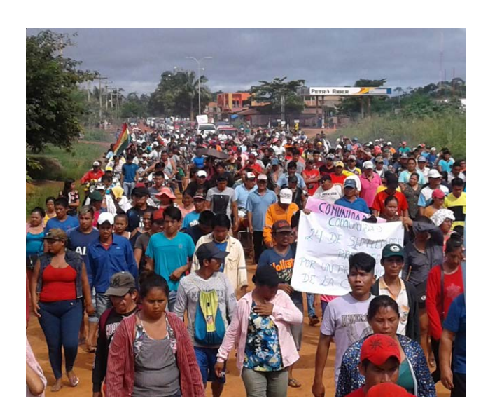
Many women took part in a protest march of chestnut pickers (below). Woman working in the Amzonian forest (above).

The International Research Program for the Assessment of Social and Gender Transformation linked to Fire Events in the Amazon Region (IRASAG-Amazon) seeks to address the highlighted lack of attention to social and gender issues in analyses of fire events. The program aims to foster exchange on this common concern of academics and practitioners in the Amazonian countries of Brazil, Bolivia, Colombia, and Peru. With funds from the International Office of the University of Bonn and led by ZEF, the research partners are working together on a comprehensive proposal to link research and policy towards informed decision-making on land management that reduces both the fires and their impacts on deepening gender inequalities.