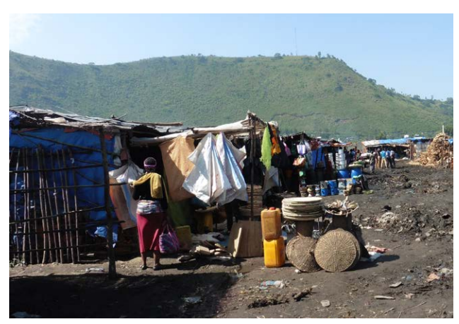
Small shops in Hawassa.

Beside poverty and other insecurities, interviewees mentioned that they were more concerned with, for example, flooding from Lake Hawassa or the outbreak of desert locust swarms than COVID-19. One of the common sayings we heard was: "No one can escape from death; we would rather die from COVID-19 than from lack of food."