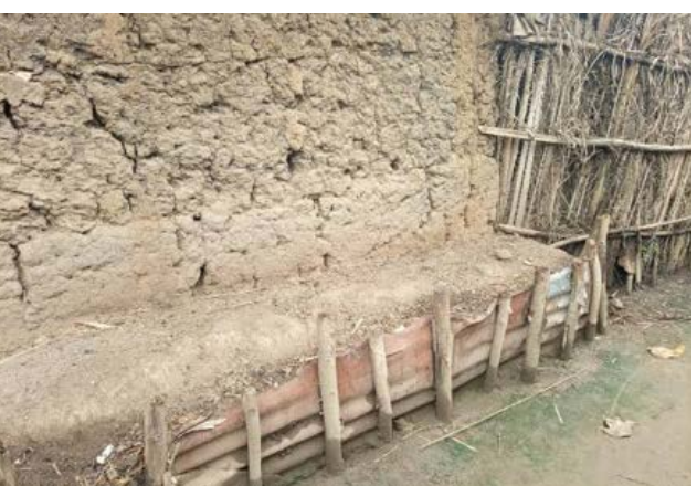
Game with a group of women (above). Flood protection of a reinforced house wall (below).

adopted by local communities, including the use of sandbags and wood to raise house entrances, the building of cement houses, the improvement of drainage systems on farm land, the installation of dams and dikes, and by temporarily moving to other places.