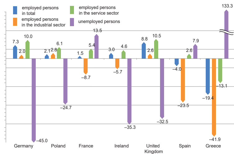
Development of the labour market in selected countries following the euro crisis (2009–2016) in %

Data source: Spatial Monitoring System for Europe, data origin: Eurostat