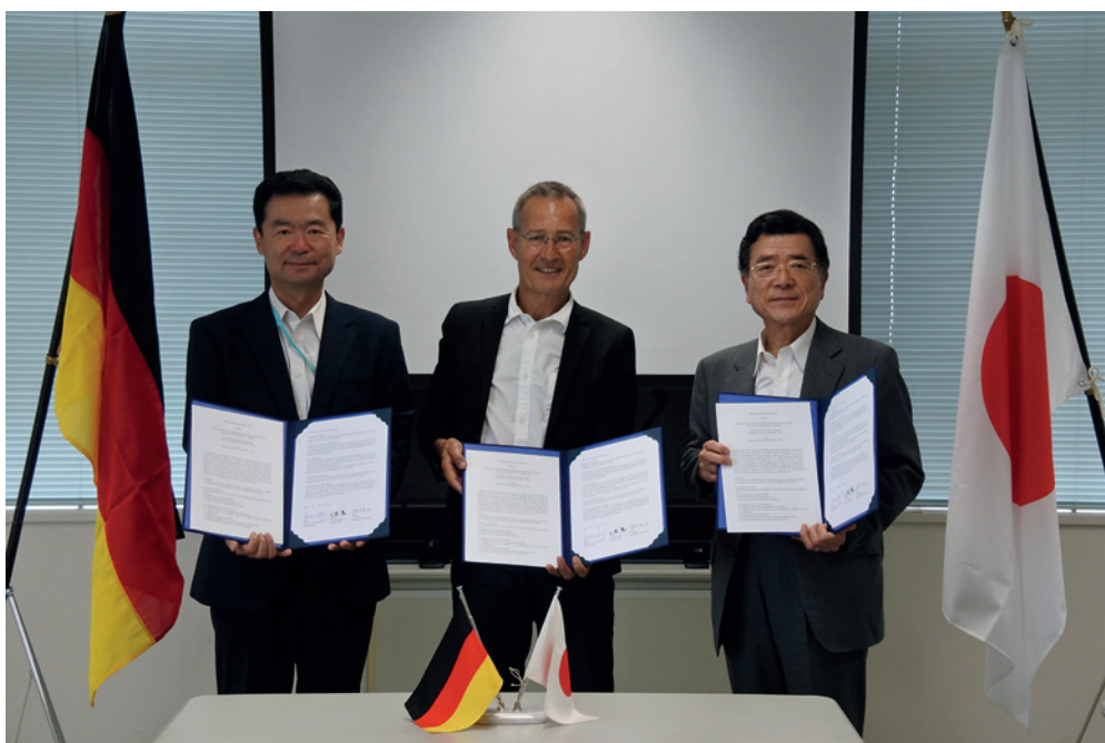
Handing over of the Memorandum of Cooperation in Tsukuba