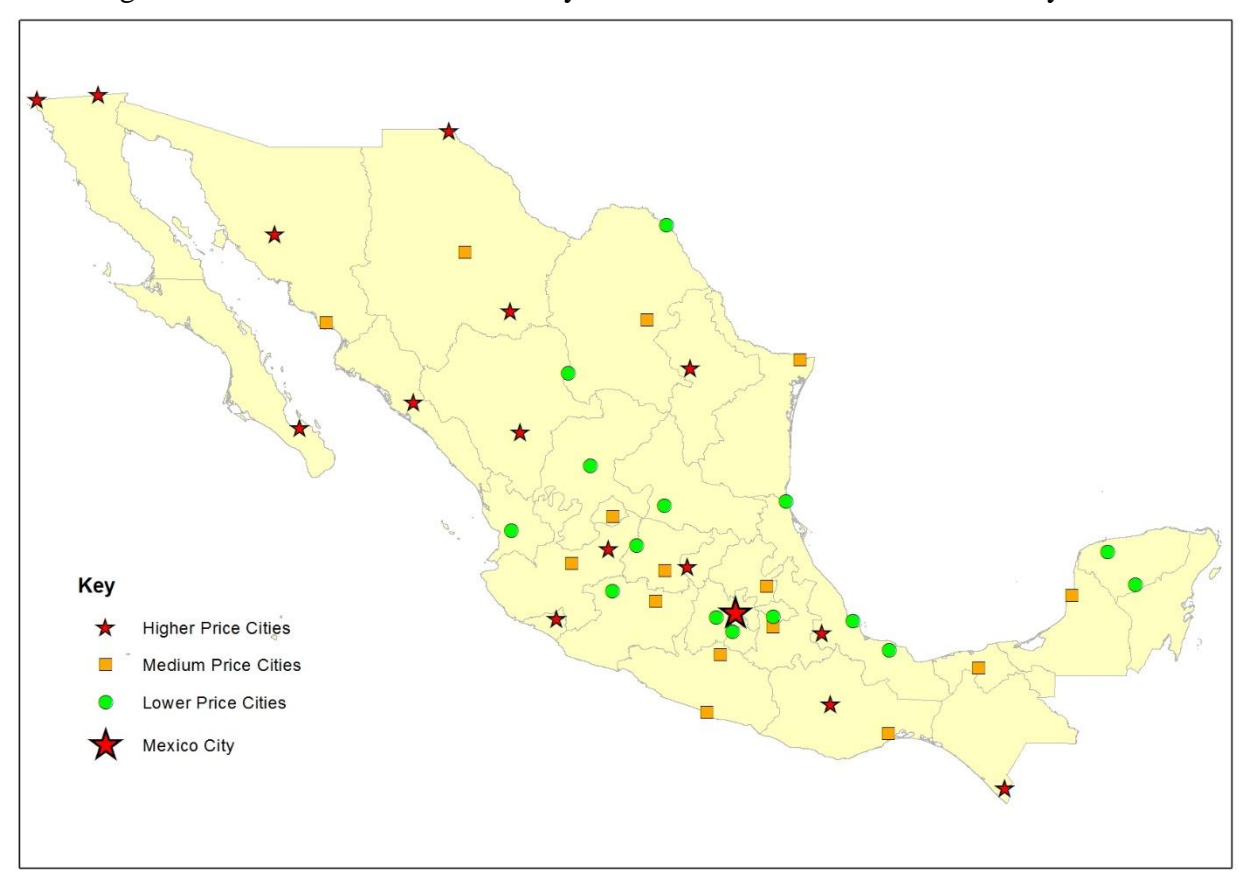
Figure 3: Cities Where INEGI Surveys Retail Prices for Basic Goods Every Month