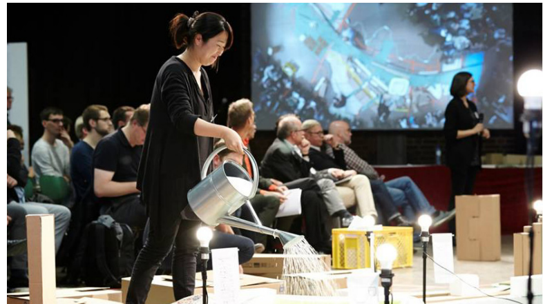
Walk-in city mock-up

appropriate for the context. One of their most successful methods is the “walk-in city mockup model”. One other important aspect was their well-designed and informative website.