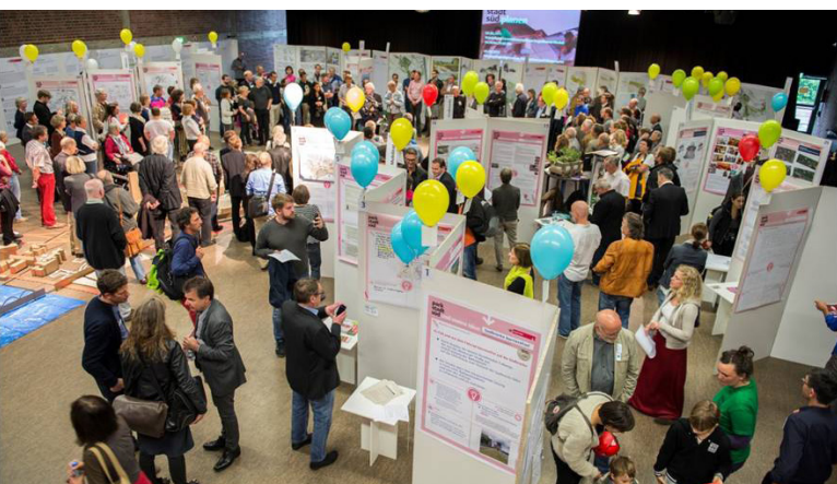
„Parkstadt Süd“ project: Consulting on development alternatives with the public