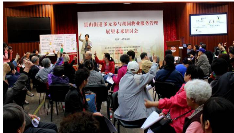
Creating public dialogue