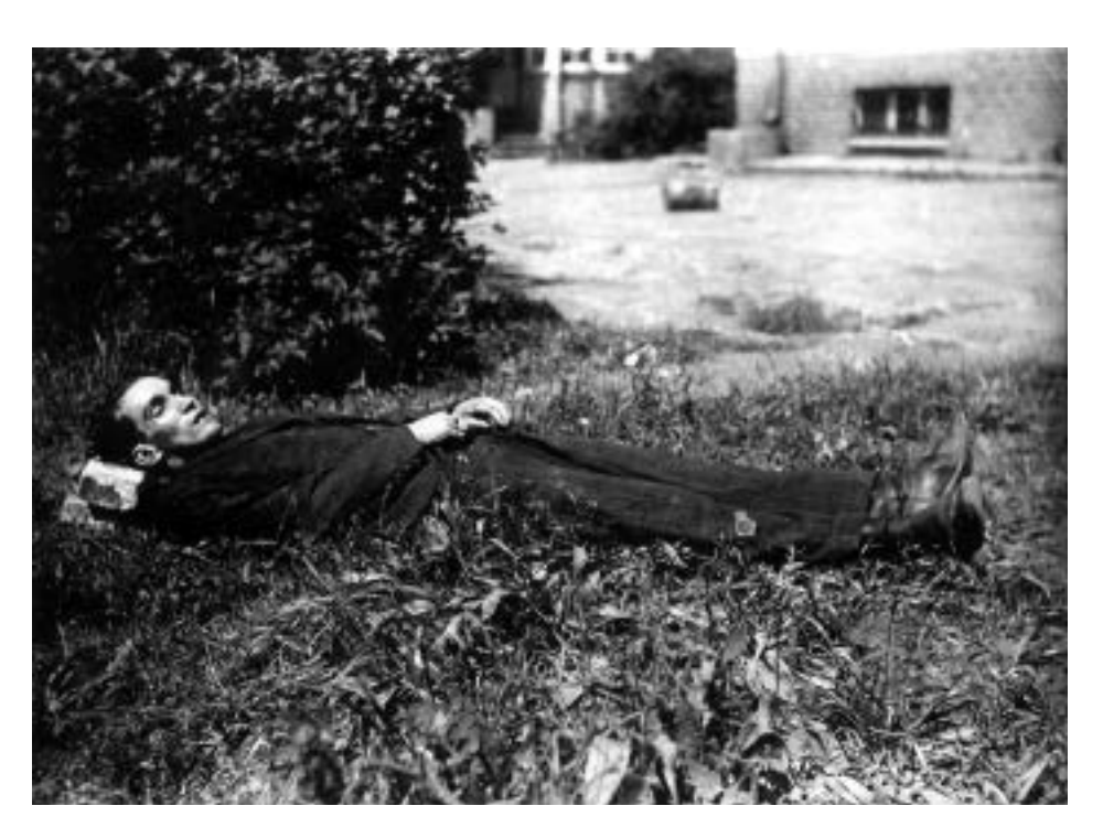
Photograph 3: Corpse of Lt. Zdzisław Badocha killed in a raid by the Secret Political Police, Civic Militia, and Internal Security Corps after transfer to the Secret Political Police office in Sztum

During Communist Party rule, places inaccessible for third parties where often chosen for burial of the corpses of the victims – as for example military training areas, prison and custody yards or Secret Political Police offices (photograph 3). The corpses of those killed in combat with