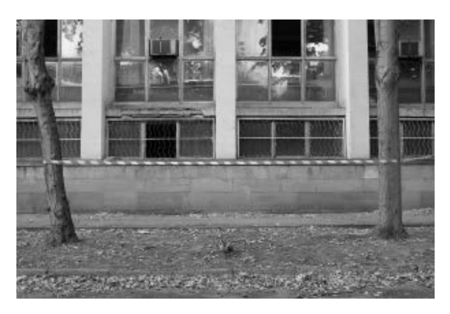
Part of the "academic town" in the Saburtalo district of Tblissi. A Soviet secret police Cheka squad was stationed in military barracks close by. Prisoners of the Cheka were executed and buried on site. The remaining barracks are now used by an English preschool.