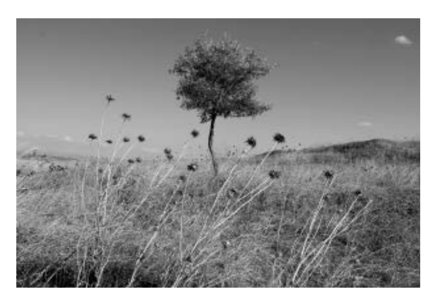
Field in Soghanlughi, Georgia. The field belongs to a farm run during the 1930s and 40s by the Soviet People's Commissariat for Internal Affairs (NKVD), closely associated with the Soviet secret police, near the Soghanlughi settlement which is located a few kilometers outside the Georgian capital Tbilisi. The field has been identified by Georgian NGO SovLab as one of the areas possibly containing mass graves from the Great Purge 1937/1938.