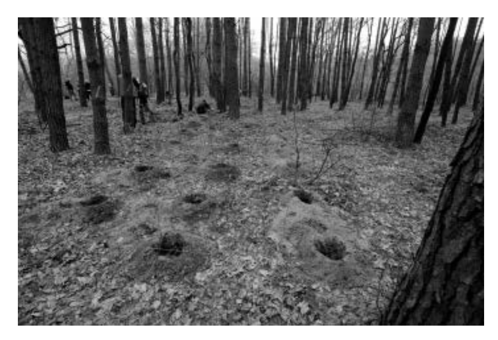
Photograph 4: Archaeological drillings made during the search for the mass graves of the soldiers of the National Armed Forces, Barut, Poland

It was decided that such complementary methods (among other approaches) would be used when, in March 2016, exploration began of the