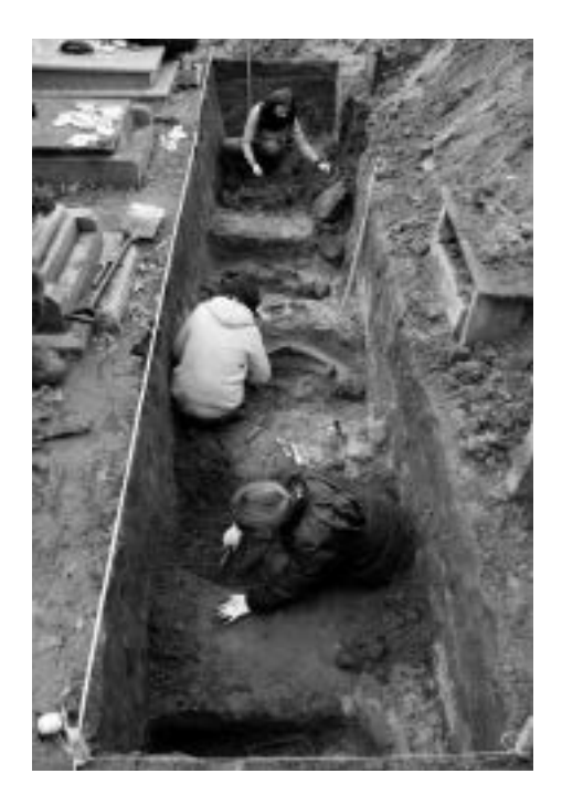
Photograph 1: Archaeological and exhumation work, Wrocław, Osobowice Cemetery, Poland

Aerial photographs can prove helpful in locating the area of the developed prison burial plots, as was the case with two necropolises in Warsaw: 1) the Powazki Military Cemetery and 2) the cemetery at Wałbrzyska Street in Służew. The first photograph (taken during an air raid over Warsaw in 1955) clearly shows diagonal dark zones which mark rows of graves. The