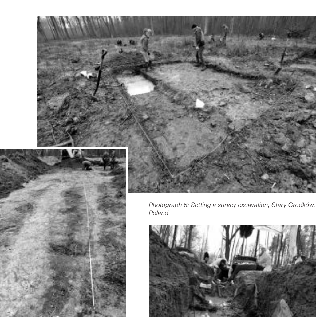
Photograph 7 A: Mass grave, Stary Grodków, Poland

Removal with an excavator of a layer of humus on an area of about five acres in the vicinity revealed outlines of mass graves, placed in craters resulting from mortar fire as well as a ditch. (photographs 7 A and 7 B)