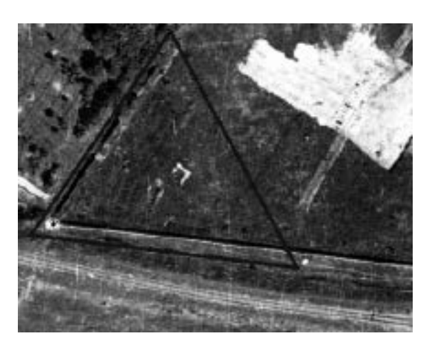
Photograph 2: A fragment of an aerial photograph from the collection of the Central Military Archive, Warsaw, 1955