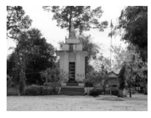
Kraing Ta Chan Mass Killing Site

From 1975 to 1979, the Khmer Rouge transformation programme caused the death of nearly two million Cambodians due to disease, lack of medicines and medical services, overwork, execution,