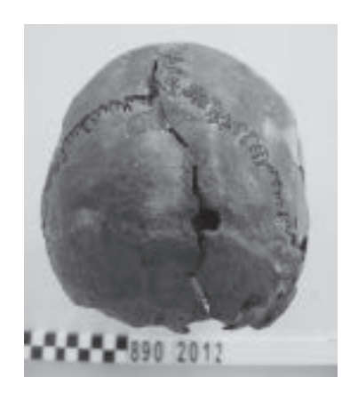
Photograph 4

PPSh and PPS. (Jureket al. 2014). Most cases represent a single gunshot from a handgun with a calibre of 7.62 mm, aimed at the back of the head (photograph 4) (Szleszkowski et al. 2015). The nature of the ascertained wounds shows a unique concurrence with the results of work carried out at the sites of execution of Polish officers in Katyn, Mednoye, and Khark-