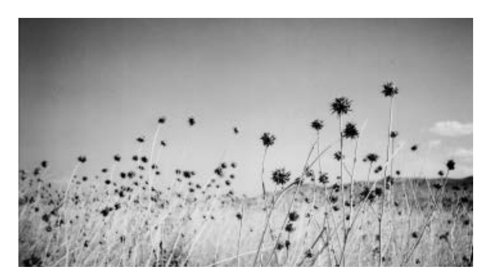
Possible mass grave site Soghanlugi, near Tbilisi, Georgia

Georgia is a small country. Tbilisi, the capital, is a small city, and in principle, probably for centuries, the same families and groups have been determining life here. Elite continuity would be the adequate term. The open-