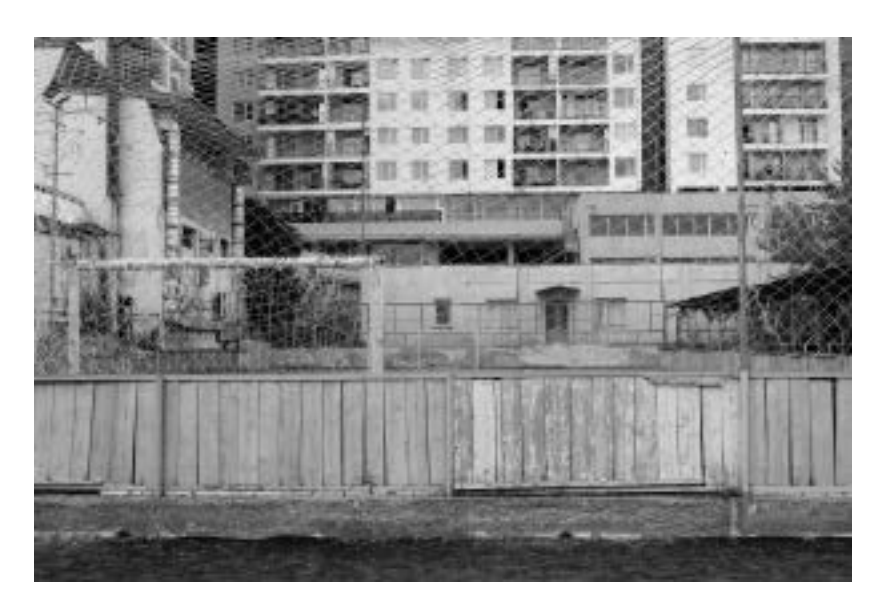
The same area from a different perspective. Vake today is still a prestigious residential area, with some of those houses erected during the 1950s being pulled down to make space for even bigger residential buildings.