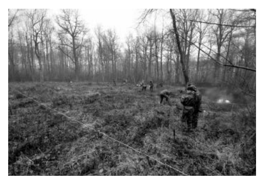
Photograph 5: Research carried out with the use of a metal detector within the designated sectors, Stary Grodków, Poland

mass graves of soldiers from the National Armed Forces serving in Capt. Henryk Flame's "Bartek" unit, who had been vanquished in 1946. On the basis of the analysis of archive materials and witness evidence it was possible to establish that a group of about thirty people (approximately one third of the unit) was transported to the area of a former Luftwaffe airport in Stary Grodków and accommodated in a mined barracks that was blown up. The first traces of mass murder were already identified during work with using a metal detector involving military engineers (photograph 5) – a gorget with the image of the Mother of God against the background of a crowned eagle presented clear evidence of soldiers from Capt. Flame's unit<sup>2</sup>.