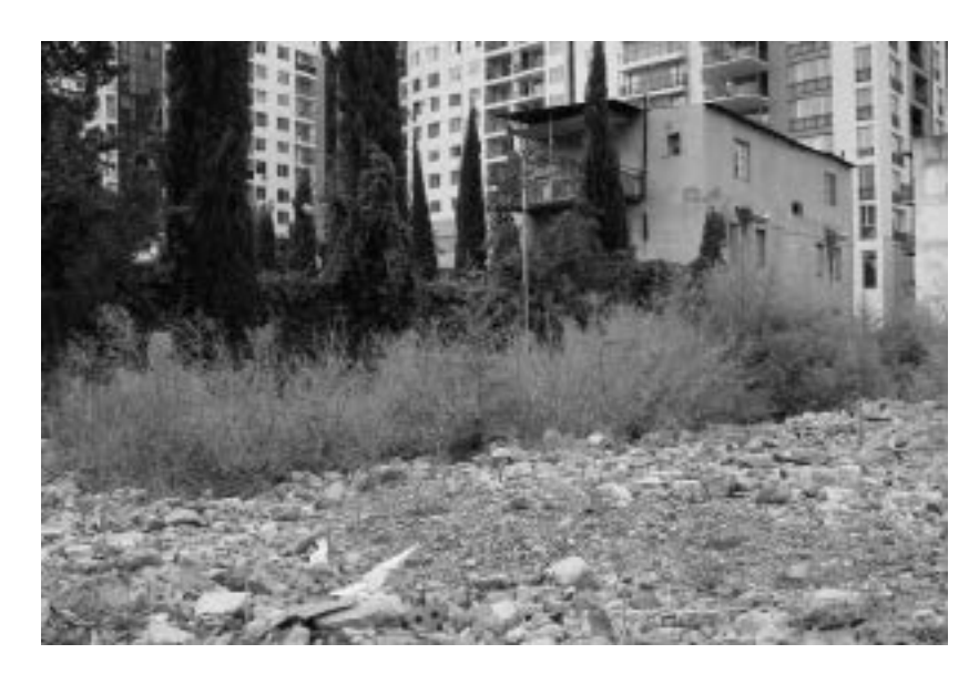
Urban space in the Vake district of Tbilisi. An unknown number of victims – but at least several hundred – were shot in this area of Tbilisi. Formerly located on the outskirts of Tbilisi, Vake has developed into a prestigious neighbourhood since the 1950s when a great number of representative residential buildings (nicknamed Stalinki in Russian) were build here. According to an urban myth dating back to this period, Vake was built "on human bones".