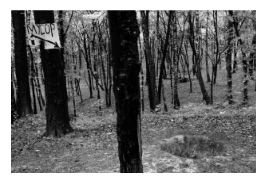
An estimated 90- to 100-thousand people where shot, burned and buried in Lisinichi forest, close to Lviv, Ukraine. The improvised sign pointing to a hole in the ground reads "garbage".