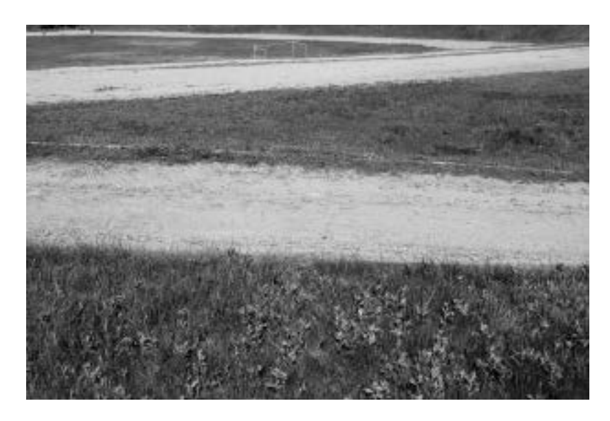
About 10,000 Jews were murdered at this huge death pit in the centre of Dnipropetrovsk, Ukraine. An entire soccer field fits into it.