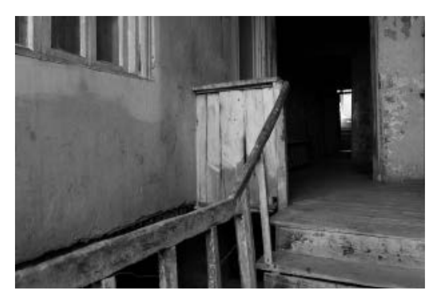
The basement of this house in the centre of Telavi (the second largest town in Georgia) was used from 1921 to 1936 as a prison of the Soviet secret police. People were tortured and also shot here. Many victims inscribed their names on the walls of their prison cells, which can still be read today. The building is still in its original state, no renovation measures have been carried out since the 1930s.