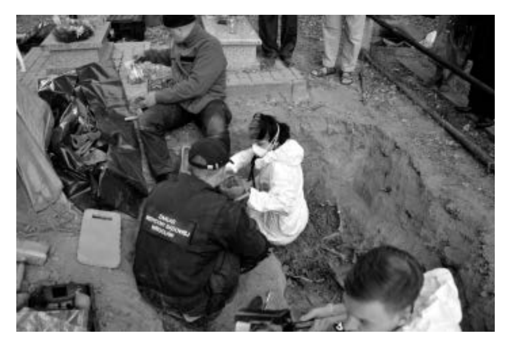
Photograph 9: Exhumation of human remains from a mass grave in Rzeszów, Poland. Each skeleton is exhumed separately

in Georgia research project. In Georgia, the search for victims of the Red Terror (1937-1939) as well as the Georgian Uprising of 1924 is still at the archival research stage. During a visit lasting several days, experiences collected during the projects conducted in Poland were shared and the directions for conducting archival research and historical gueries discussed and set. Archive material and evidence given by eyewitnesses focussing on three areas was examined. Preliminary exploration work, examinations and surface surveys were initiated on two of these areas - one on the grounds of a former artillery barracks of the 1st shooting range for cadets in Tbilisi (Saburtalo, Vake), the other on the grounds of the farm of the People's Commissariat for Internal Affairs in the Soghanlughi valley - were conducted in coordination with the chief-investigator of the Georgian project, Irakli Khvadagiani. In one of the selected places (Vake), research by ground-penetrating radar (GPR) was conducted and drillings were made in the place where an anomaly in the soil structure had been identified. No human bones (nor traces of human activity, except for its upper layer) were found in the ground explored - but it must be said that was some