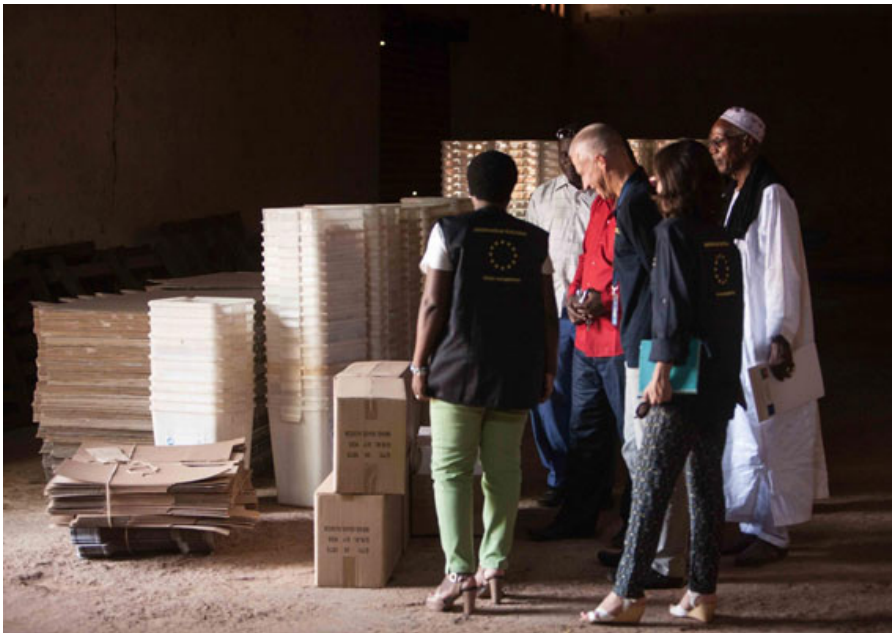
European Union Election Observation in Burkina Faso.

Burkina Faso is slowly emerging from a tumultuous period marked by the popular uprising of October 2014 and the troubled political transition, which will formally end with the swearing-in of the new institutions, elected on 29th November 2015.