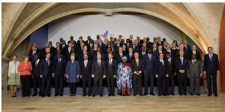
Heads of State and Government of the EU and the African Union (AU) at the Valletta Summit on Migration on 11 and 12 November 2015 in Malta.