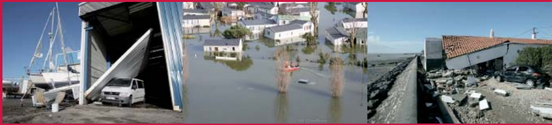
Perimeter of the PAPI.

The PAPI is expected to last for the next 5 years ( 2013-2017 ) and takes as a starting assumption a sea level 20 cm higher than the one observed during Xynthia flooding, taking into account the sea level rise due to climate change. This 20 cm higher level would triple the surface of the flooded area and would increase dramatically the people and goods impacted. The new strategy is developed on two main axes. The first one is the risk culture and its integration into the planning and development of backup plans based on early warning systems. The second one is the protection of human, economic and urban-related issues; with a particular focus on touristic ones (the region is highly touristic