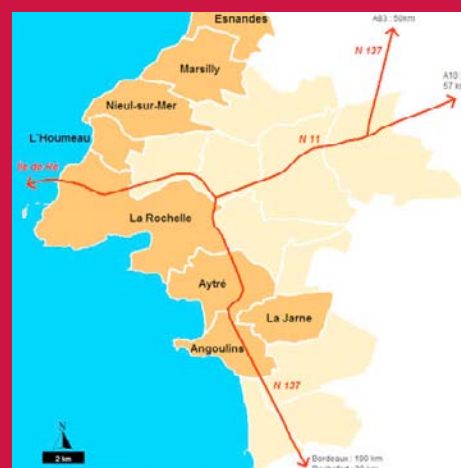
Perimeter of the PAPI.