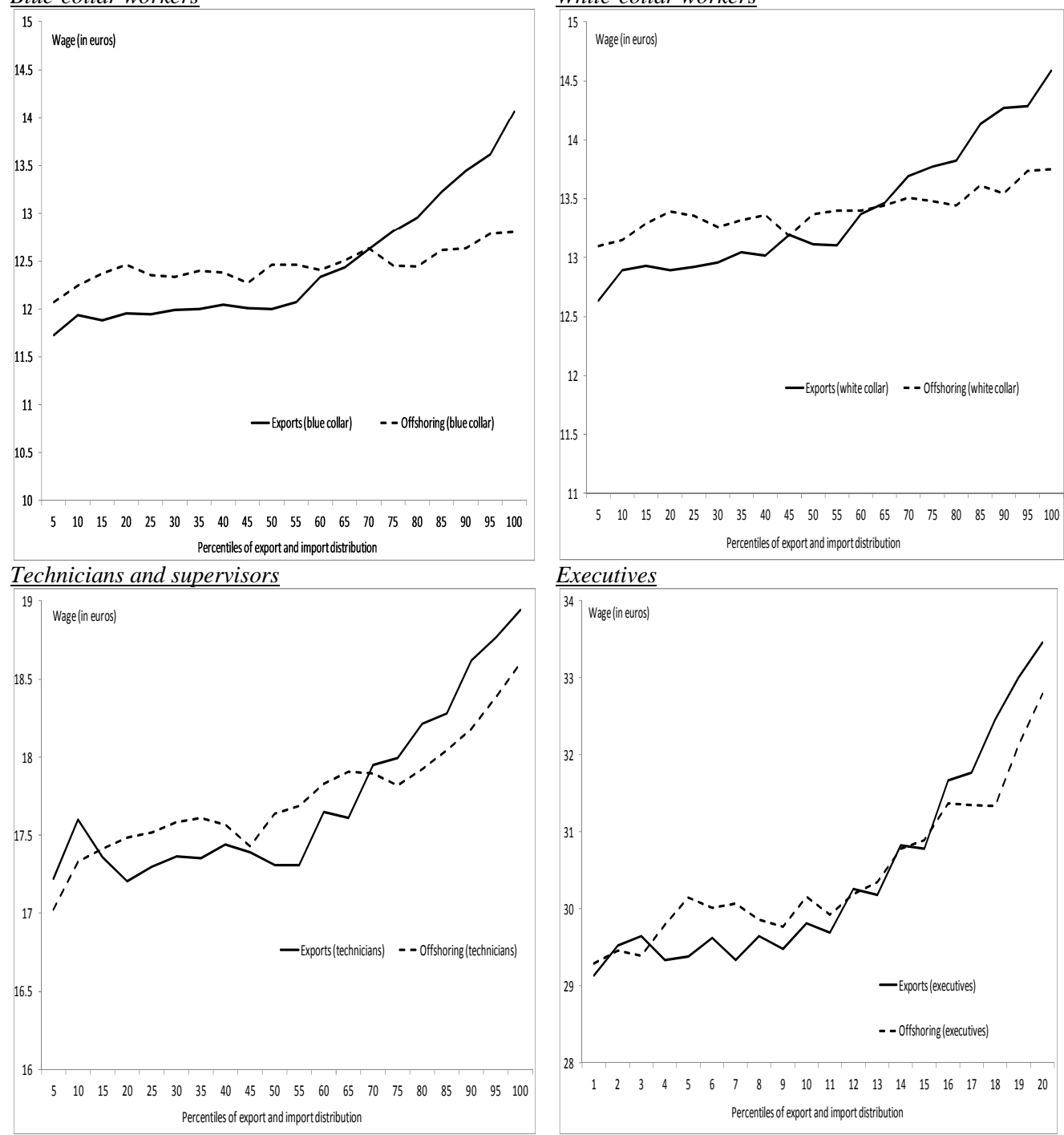
Figure 2: Average Wages by Percentiles of the Export and Offshoring Distributions by Occupation <u>Blue-collar workers</u> <u>White-collar workers</u>

Notes: We report the average hourly wage in euros as a function of percentiles of the export and offshoring distribution. 'Offshoring' is defined as imports of goods belonging to the same industry as that of the importing firm (see Section 2 for details). We use export and offshoring per employee to control for wage differences due to firm size differences. We then compute percentiles of the sample distribution and calculate the average hourly wage at each percentile of the export and import distributions. Period: 2005-2009.