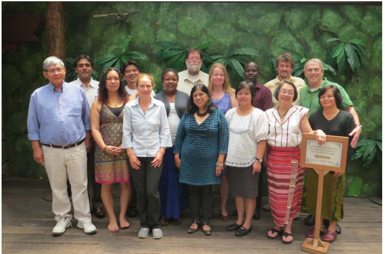
International Expert workshop

Indigenous valuation of biodiversity and ecosystem services compared to other ways of valuation in the context of IPBES, August 11th to 14th, 2014 in Mandaluyong City, The Philippines