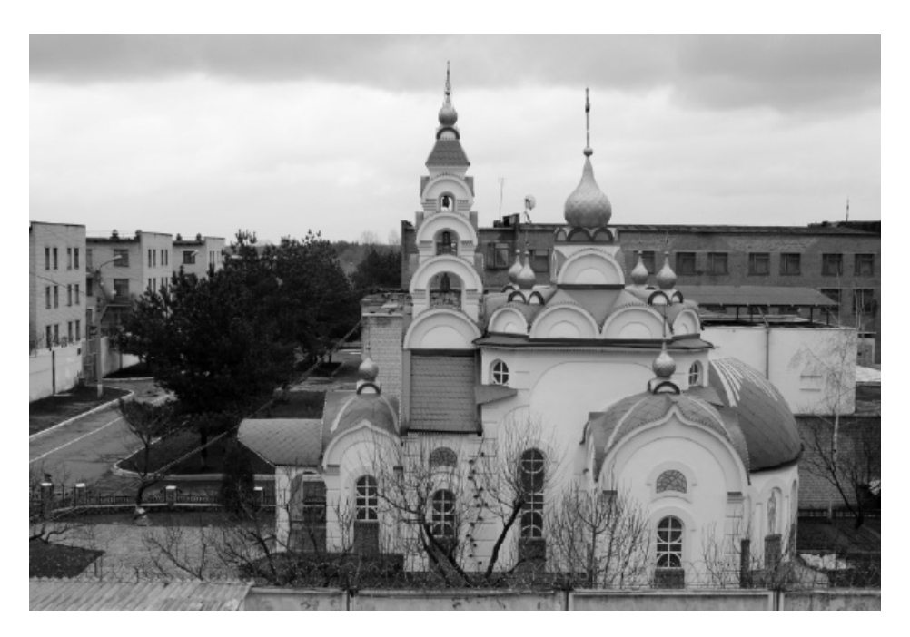
View of the prison complex in Poltava City

efficiently, and besides, to exercise their vision: to add new elements, to offer new alternatives of versions of both elements and construction as a whole." Another significant point, according to the teacher, is the environment in the group. "All students are equal to each other. They all have their own destinies, the term that they spent in prison, but they have an equal chance to start life anew, acquire a profession, recover the existing and establish new social ties, settle down to a married life."