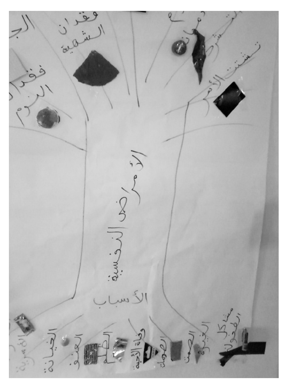
The Reflect-method uses the so-called "problem tree" as a tool for visualisation and analysis