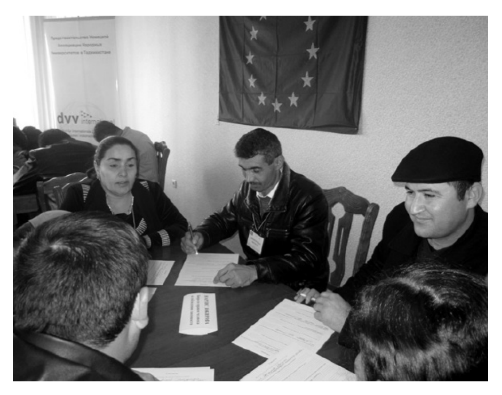
Training of prison staff on international standards of detention of the incarcerated

(Training of Trainers) on adult learning methodology and coaching for vocational masters/instructors to be prepared by the female prison staff. The civic education and personal development trainings for female prisoners are an important component of the project. In addition, a set of events will be arranged in the female prison during the Education Days planned by Jahon.