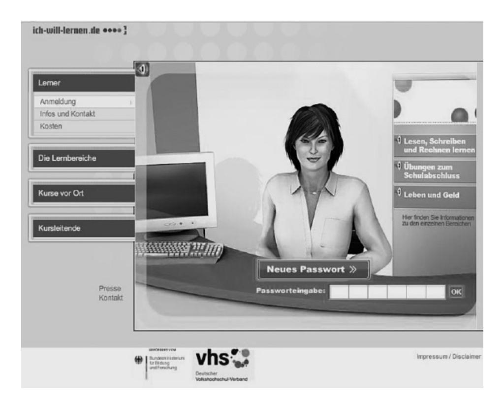
Homepage of www.ich-will-lernen.de

messages via PC through a special system, a service that is, however, connected with significant costs for the users.