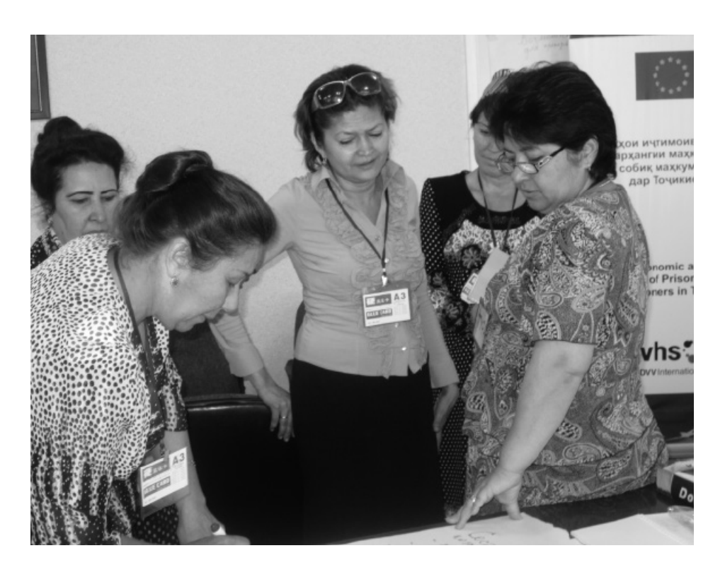
Training of prison educators in Dushanbe 2014

also for the staff of penitentiary institutions. The participants were able to deliberate on how to harmonize the national legislation of the Republic of Tajikistan with the international standards. One of the main conclusions made by the trainees was that low professional and legal preparedness of the penal staff leads to use of coercive methods: harassment, violence, threats and other illegal measures.