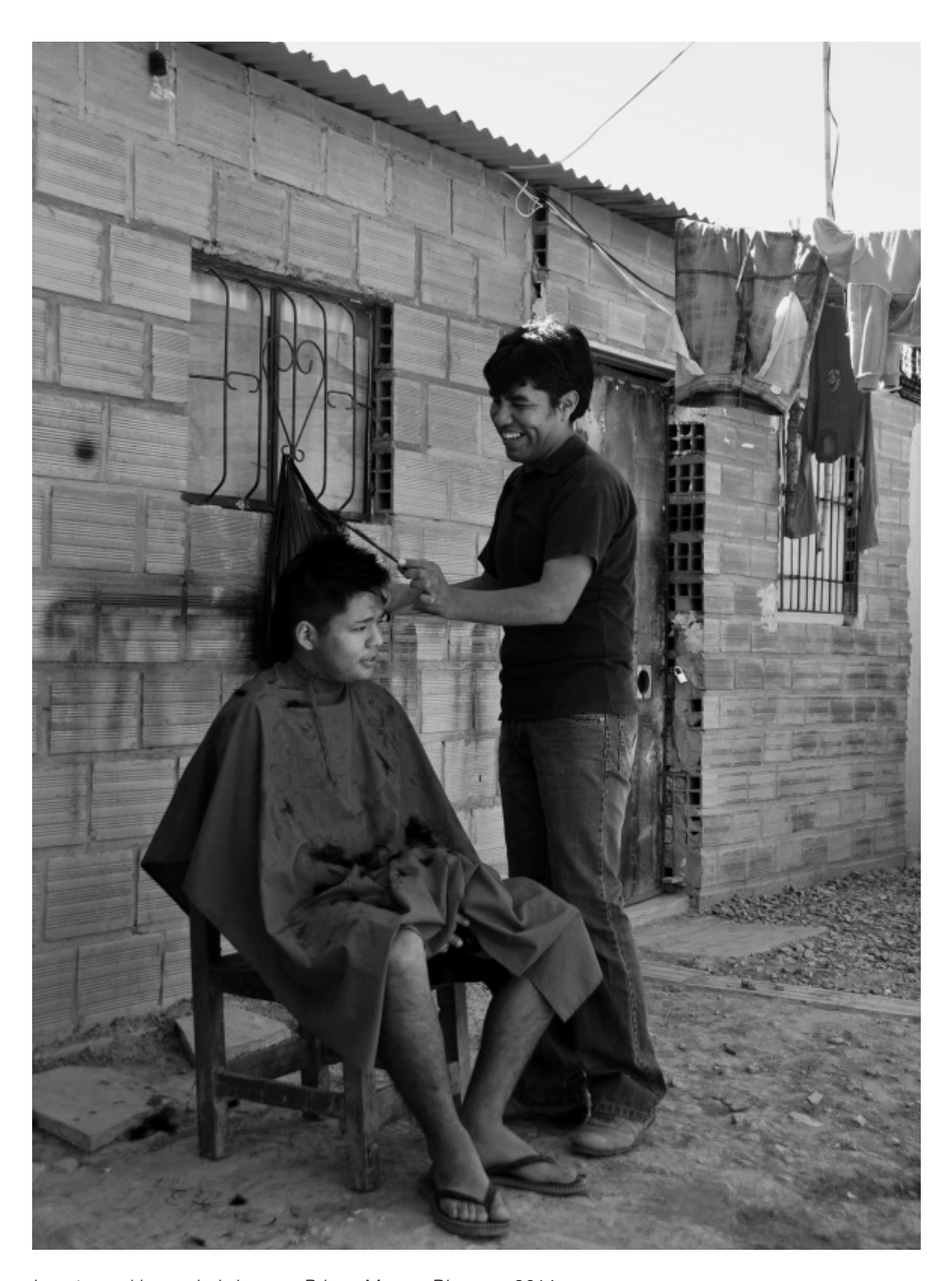
Inmate working as hairdresser, Prison Morros Blancos, 2014