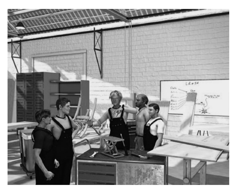
Example picture of the topic "work"

certificate exam and is available for use anywhere. Since 2007, the online portal www.ich-will-lernen.de has been available to prisoners and teachers in correctional facilities as an attractive and modern way of training.