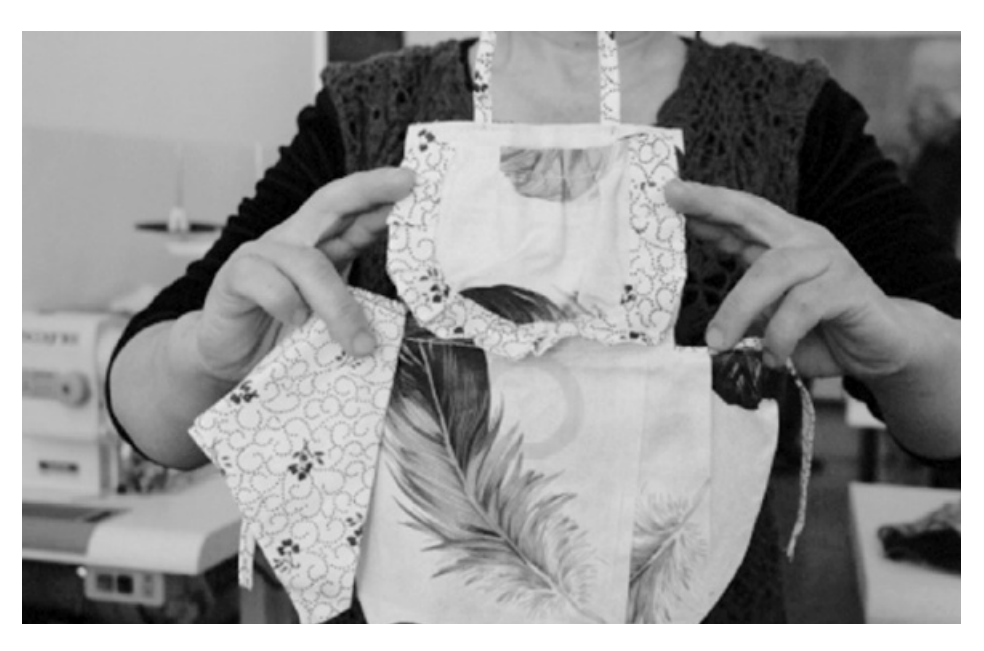
Presenting vocational training results made by an incarcerated woman