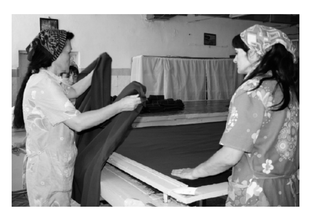
Vocational training on sewing for female prisoners

steps after release" are provided. There is a general idea in our society that prisoners are kept in hard conditions in a penal institution, and this is in fact true. But the real problem begins with the release from prison.