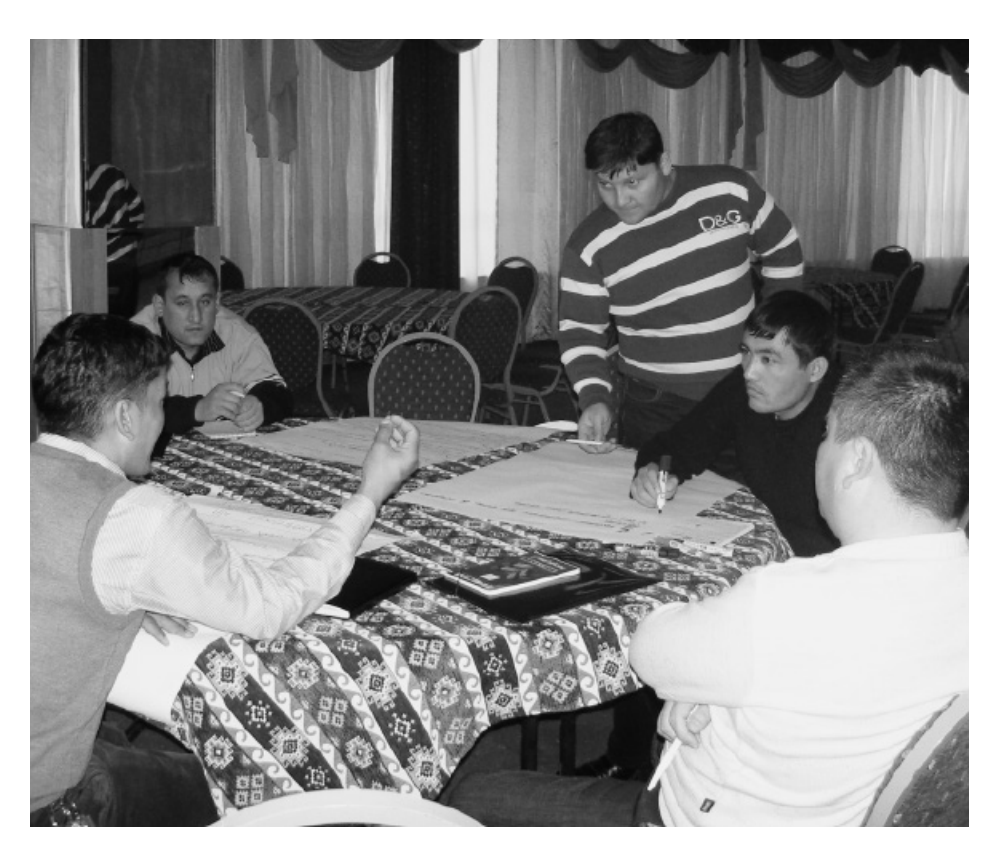
Further training for prison staff on professional ethics

ment of lawyers, psychologists, representatives of governmental structures (Centres of social adaptation, Ministry for Labour and Social Protection) and public authorities. At the meetings the participants were encouraged to share problems they faced after release. Among the problems they have experienced were: registration at the former place of residence, registration and obtaining documents, obtaining free law consultations and medical care, limitations due to impossibility to work in a profession, low salaries, psychological problems associated with the rejection of an ex-inmate by relatives and friends, impossibility to help the family due to the absence of work. Some women shared their successful experience of solving problems. The main conclusion to which the participants came is that the preparation course for release should start from the first day of serving a sentence, not just several months prior to release. After release