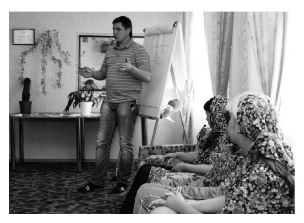
Life skills training for female prisoners in Poltava City

managed to attract another partner, Poltava City Employment Centre, that allocated funds in the amount of 56,000 hryvnia from the fund of obligatory state social unemployment insurance to be paid for public works of our clients, and owing to this, 35 jobs were found for former prisoners.