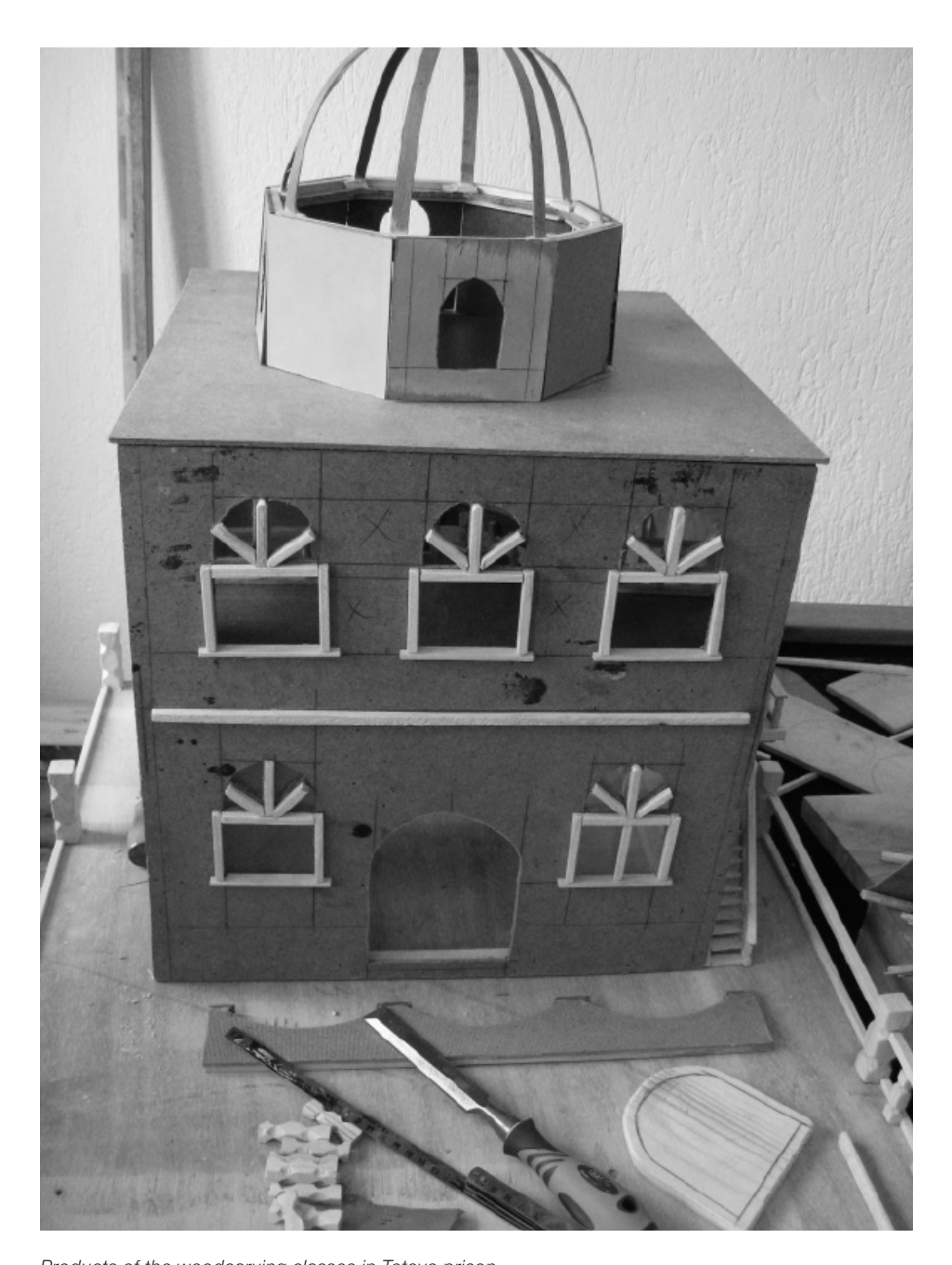
Products of the woodcarving classes in Tetovo prison