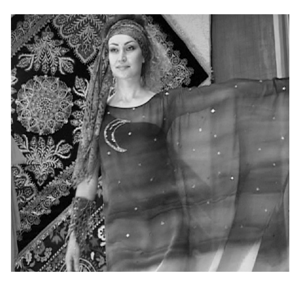
Presentation of the project results in 2011. All textiles were made by incarcerated women on vocational courses supported by the project

the opportunity to think about their life, in 2013 a diary with the title "Time manager" was developed and included a calendar, motivating postcards, poems and articles with various issues, such as "What should be done in order to obtain self-esteem?", "The best make-up", "How to get over your own fears and problems", "Why can you not be liked by other people?". After each text the diary contained plain sheets to give the inmate the possibility of writing personal notes. Women have already asked for the continuation of this action because they liked the idea, and now they are proposing themes which can be included in the next diary.