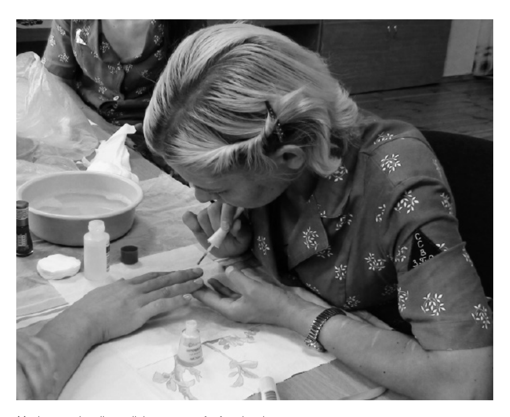
Manicure and pedicure diploma course for female prisoners

e) Forming the groups with regard to gender, social status, age and level of the trainees, e.g. male inmates who had repeatedly violated the established order of serving their sentence, as well as individuals requiring more attentive supervision (potential offenders) were invited to enrol in the social and psychological support programme. The social adaptation level of the target group members was evaluated as insufficient, whereas the level of "criminal contamination" was reported to be relatively high. It manifested not only in the violation of the regimen, but also in the absence of a stable place of work, and unwillingness to restore the old socially useful ties as well as establish new ones. In the female correctional colony, training groups were formed of female inmates with 6-8 months left until release. In both cases the main principle of enrolment was voluntary consent of the prospective trainee.