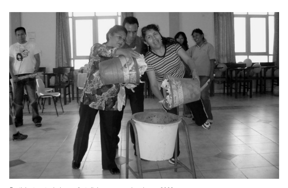
Participatory technique - first diploma course in prisons, 2008