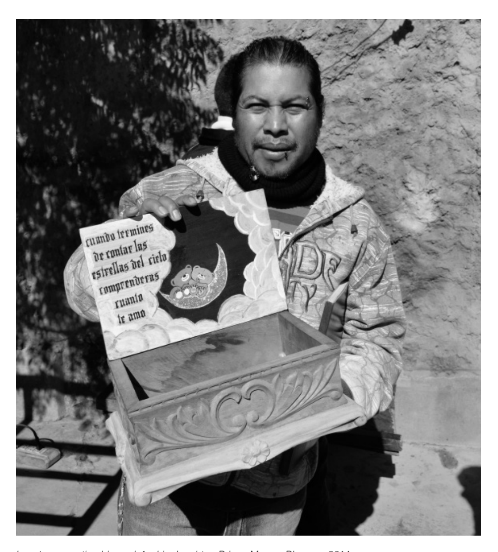
Inmate presenting his work for his daughter, Prison Morros Blancos, 2014

the construction of the theoretical, in the discussion of strategies and in the development of educational conduct for educational activities. The participatory nature of the action of building educational policies shows the collective essence of educational change.