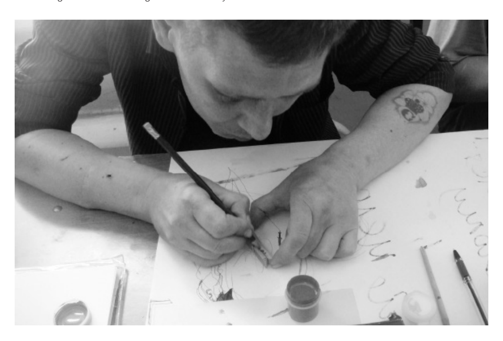
Participant of a life skills course, which was a crucial part of the vocational training programme