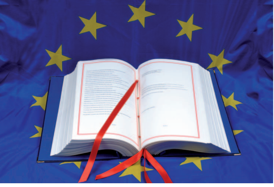
The Lisbon Treaty, signed in 2007, entered into force on 1 December 2009. It lays the foundation for the Union's procedures, policies, and performance.