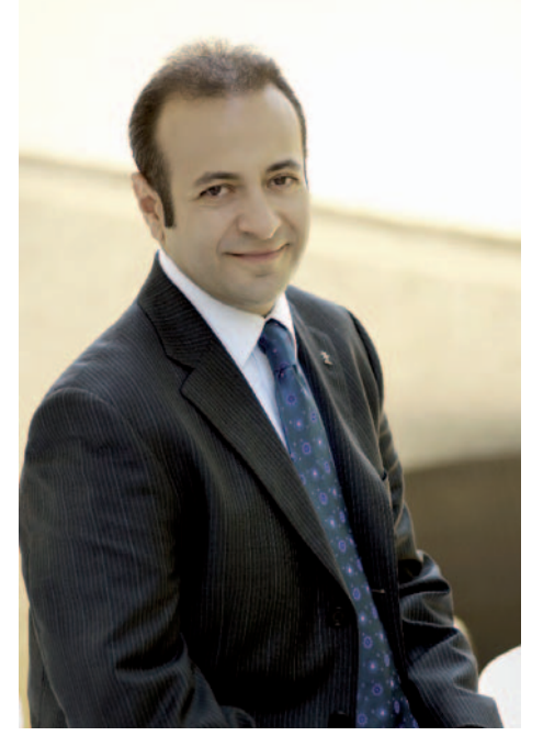
Egemen Bağış, Minister for EU Affairs and Chief Negotiator.

As for the Cyprus issue, the decision of the EU Council of 26 April 2004 to put an end to the unfair isolations imposed on the Turkish Republic of Northern Cyprus has not been implemented yet. The commitments in this respect, such as direct trade and financial assistance, have not been respected.