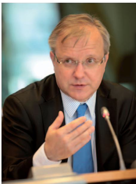
Commissioner Dr. Olli Rehn in March 2009 at the EP.

On the EU side, it is crucial that we continue to pursue a consistent policy. The Commission remains fully committed to the EU agenda for Turkey's accession, unanimously agreed by Member States in 2005.