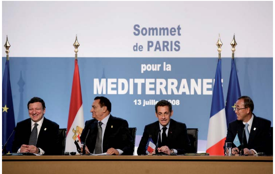
Commission President José Manuel Barroso, Hosni Mubarak, President of Egypt, Nicolas Sarkozy, President of the French Republic, and Ban Ki-moon, Secretary General of the UN at the founding ceremony of the Union for the Mediterranean. Despite the French President's high expectations, many remain sceptical.