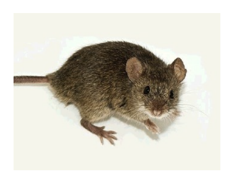
Figure 1 : Picture of a mouse as presented in the instructions of the experiment.

unsuited for study. They were perfectly healthy, but keeping them alive would have been costly. It is standard to gas such mice. This is common practice in laboratories conducting animal experiments. Thus, as a consequence of our experiment, many mice that would otherwise all have died were saved. Subjects were informed about this default in a post-experimental debriefing.<sup>5</sup>