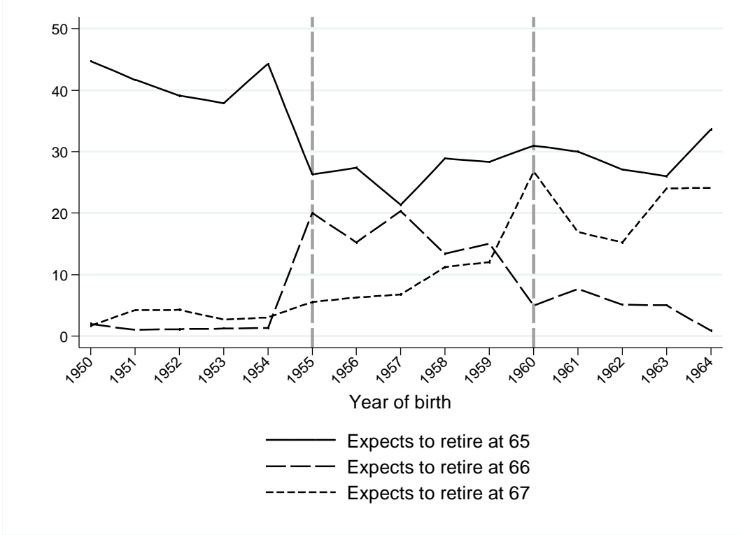
Figure 1: Percentage of employees who expect to retire at age 65, 66, or 67, by birth year